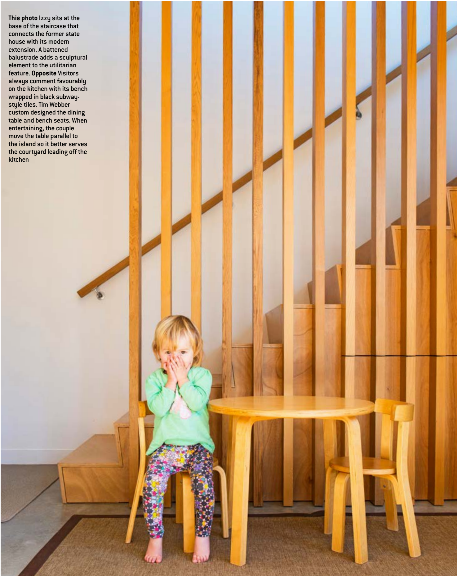
This photo Izzy sits at the base of the staircase that connects the former state house with its modern extension. A battened balustrade adds a sculptural element to the utilitarian feature. Opposite Visitors always comment favourably on the kitchen with its bench wrapped in black subway-style tiles. Tim Webber custom designed the dining table and bench seats. When entertaining, the couple move the table parallel to the island so it better serves the courtyard leading off the kitchen