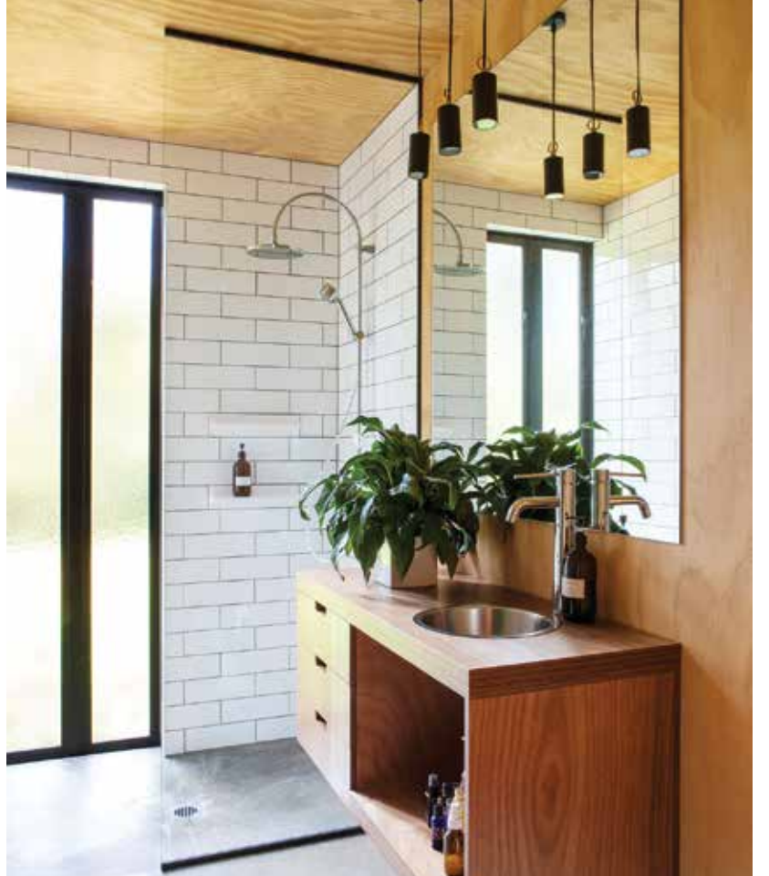
top The owners wanted a home that captured the casual holiday spirit and in the kitchen, cabinetry made of plywood and panels of bold colour do the trick. The board-and-batten wall that helps to define a separate office/spare bedroom is a continuation of the exterior cladding. bottom left & right Built-in shelving, beds and headboards, along with bathroom vanities, were not only a space-saving approach, but obviated the need for furnishings which was kinder on the budget.