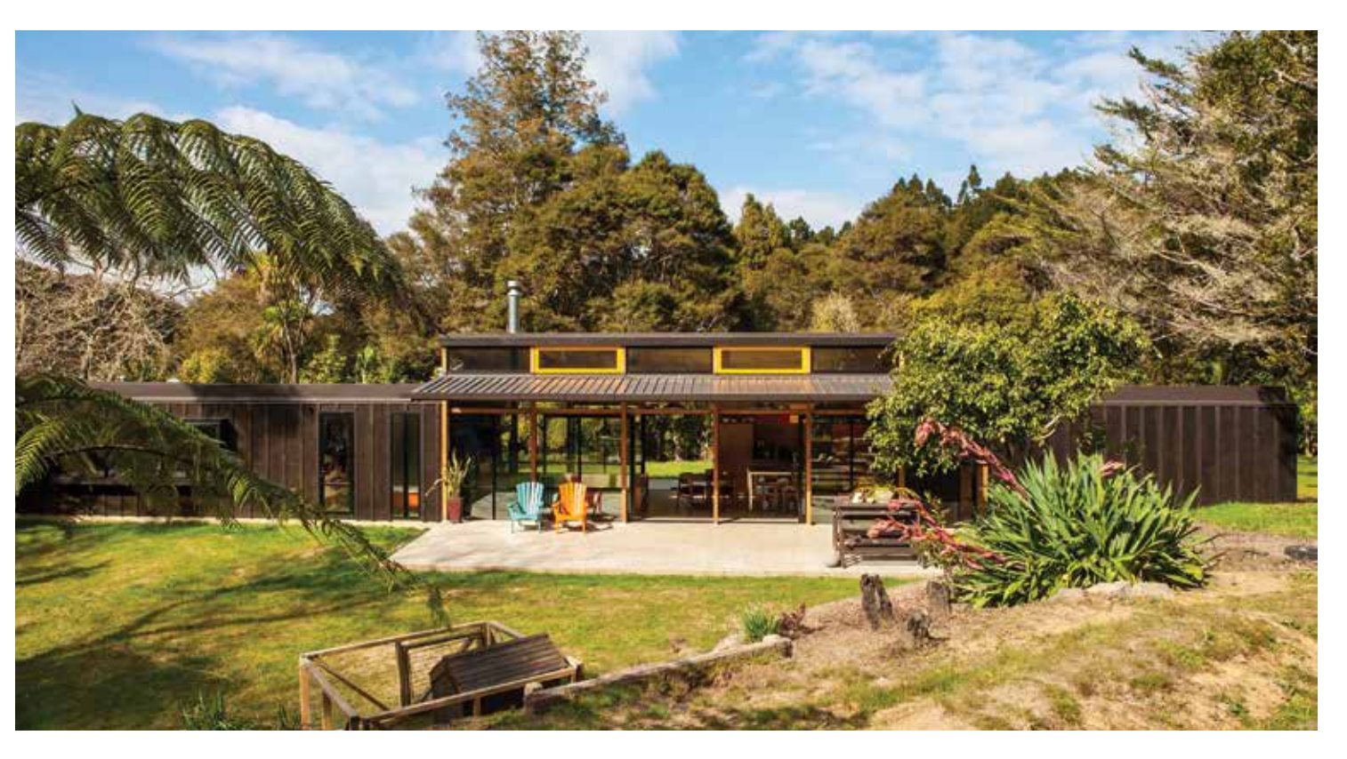
Located in the suburb of Titirangi, west of Auckland, the home has a rural aesthetic that is fitting for its setting. Although the main house is only 120-square-metres, the seamless connection to the outdoors, and the soaring mono-pitch roof, makes it feel much larger.